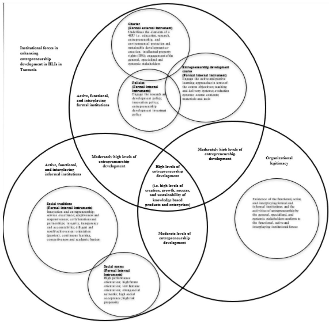
Figure 3: The Tripartite Institutional Framework for Enhancing Entrepreneurship Development in HLIs

The study finds that commercialization of research discoveries and knowledge from the HLIs in Tanzania does not exist in a significant way (fully realized/high levels), aside from the three institutional dimensions suggested in the framework, which need to be functional, active, and interplaying. This indicates that any attempts made outside of the framework (TIFEED-HLIs) to enhance entrepreneurship development in HLIs in Tanzania will not be fully realized. The figure below presents the TIFEED-HLIs.