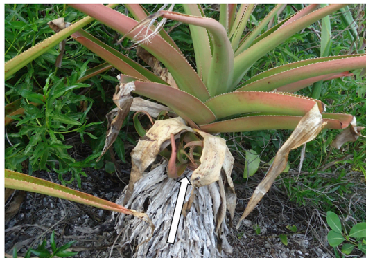
Fig. 2. Aloe pembana young vegetative shoot on the side of its upper stem at Pemba island, December 2018.

The species of “Least Concern”, A. lateritia , outperformed other species across all treatments in its germination success, followed by A. secundiflora and A. volkensii . This is supported by other researchers who reported the first two species being widely distributed across different geographical areas of various climatic conditions (Abihudi et al., 2019; Bjorå et al., 2015;